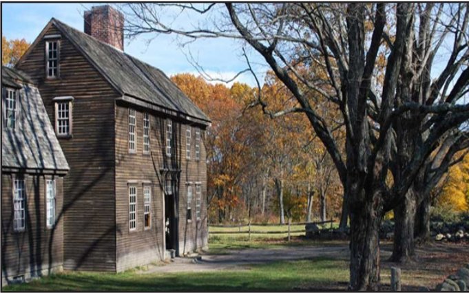
Hartwell Tavern, Lincoln, Massachusetts

Hartwells of America 385 S. Main St. Attleboro, MA 02703-6409