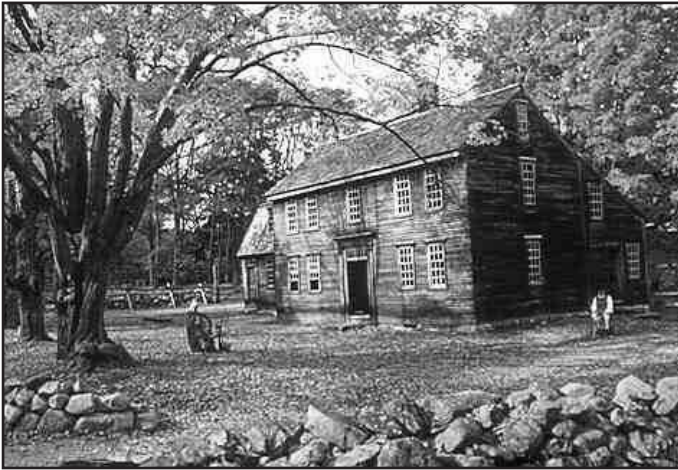
Hartwell Tavern, Lincoln, Massachusetts

Hartwells of America P.O. Box 476 Foxborough, MA 02035