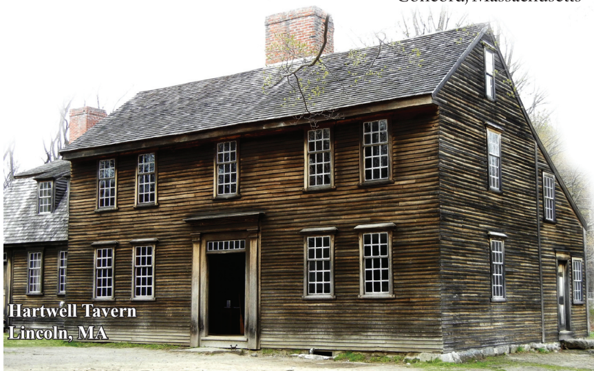
Hartwell Tavern Lincoln, MA

Hartwells of America 7 Birch Tree Road Foxboro, MA 02035