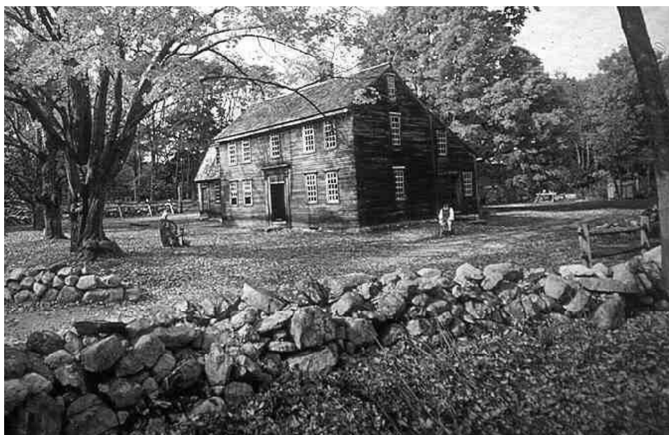
Hartwell Tavern, Lincoln, Massachusetts

Be sure to visit The Hartwells of America Association's Web site— www.hartwell.org —and check out the Message Board for the latest news.