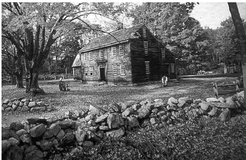
Hartwell Tavern, Lincoln, Massachusetts

Be sure to visit The Hartwells of America Association's Web site— www.hartwell.org —and check out the Message Board for the latest news.