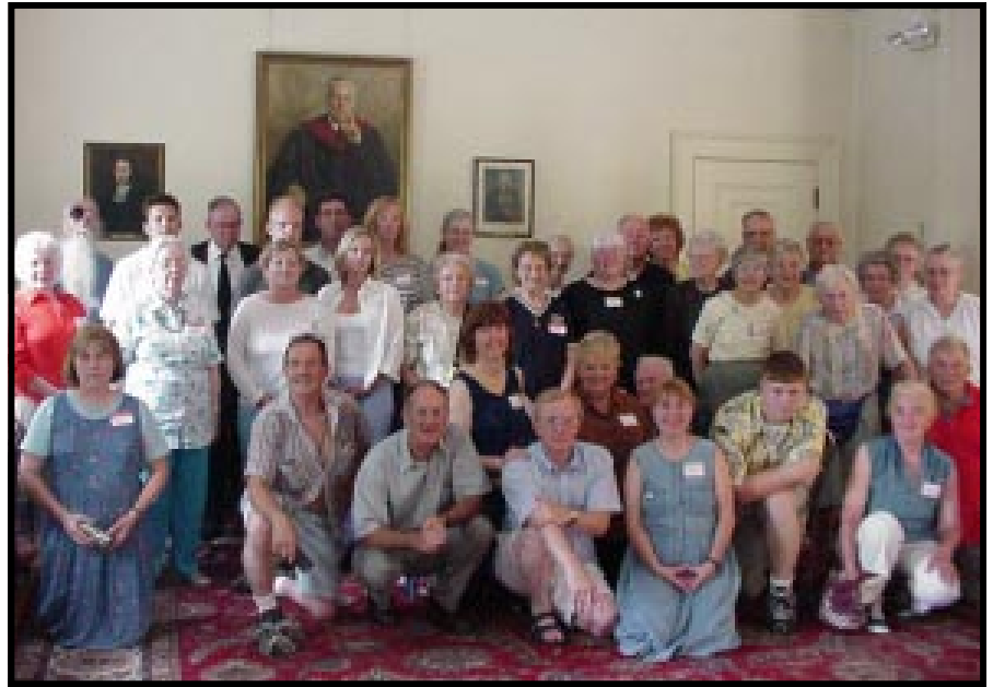
2001 group shot