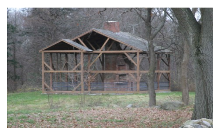
Samuel Hartwell House, Battle Road, Concord MA

Hartwell house along the Battle Road in Minute Man National Park in Lexington). I vividly remember staring at a smoking ruin, a building that bore my name, that had played a role in the American Revolution (I had visited Williamsburg before then so I knew of that war, and I loved hats – my three-corner hat from that trip sat on my head for months afterwards). That's a sense of history you can touch but can't teach.